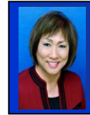
Colleen Hanabusa (D)