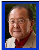
Daniel Inouye (D)