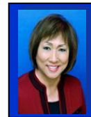
Colleen Hanabusa (D)