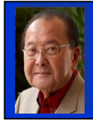
Daniel Inouye (D)