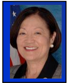
Mazie Hirono (D)