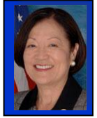
Mazie Hirono (D)